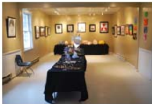
Offspring Art Show at Boynton House